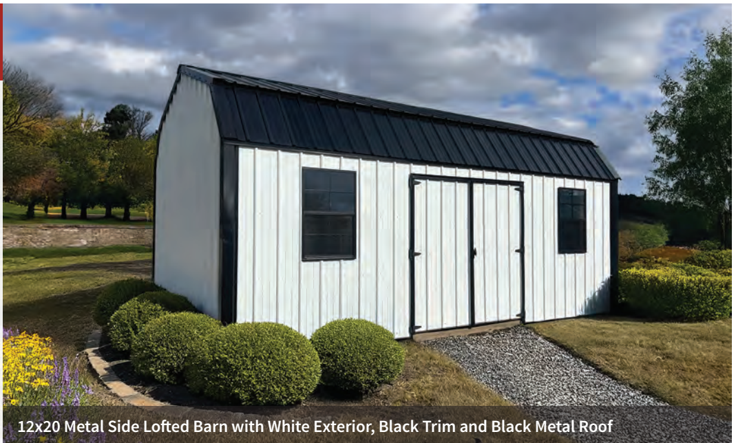
12x20 Metal Side Lofted Barn with White Exterior, Black Trim and Black Metal Roof