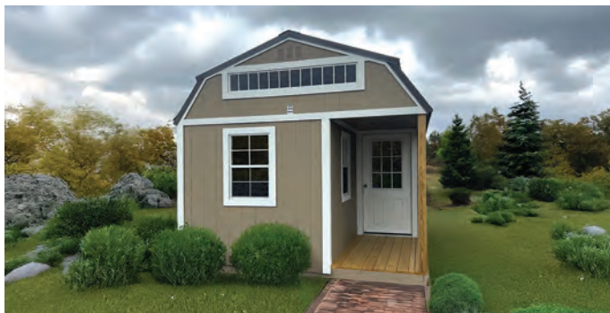
72" Transom Window in Loft