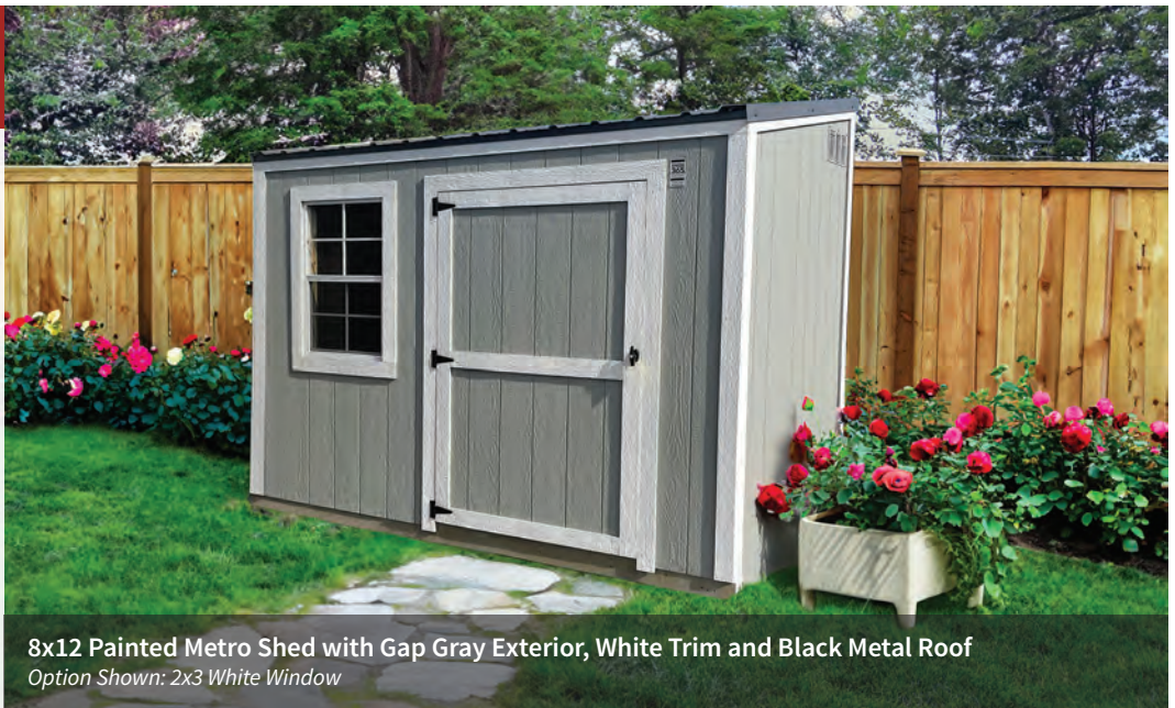
8x12 Painted Metro Shed with Gap Gray Exterior, White Trim and Black Metal Roof Option Shown: 2x3 White Window