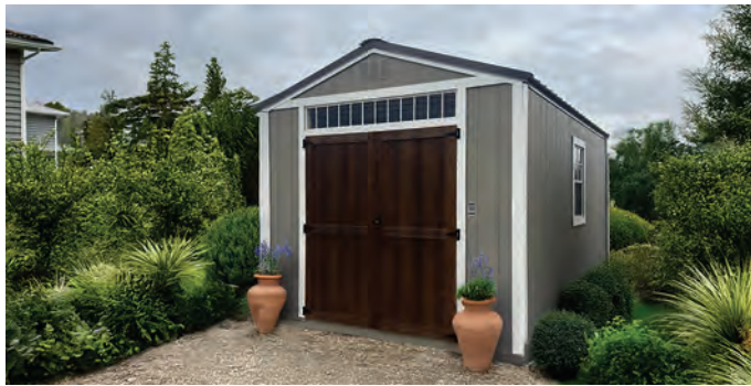
72" Transom Window Above Door