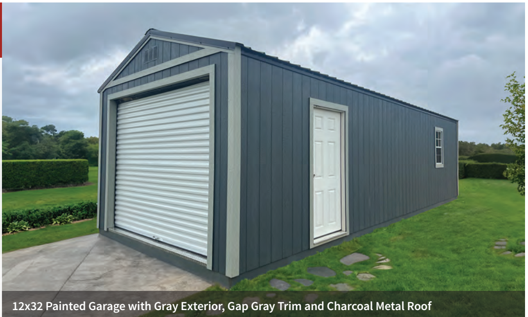
12x32 Painted Garage with Gray Exterior, Gap Gray Trim and Charcoal Metal Roof