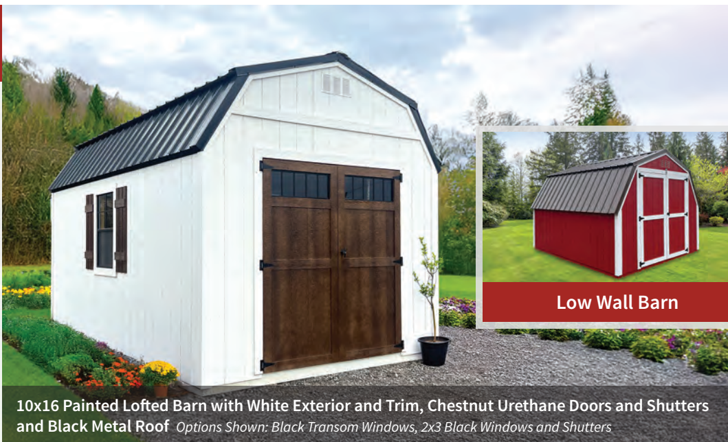
10x16 Painted Lofted Barn with White Exterior and Trim, Chestnut Urethane Doors and Shutters and Black Metal Roof Options Shown: Black Transom Windows, 2x3 Black Windows and Shutters