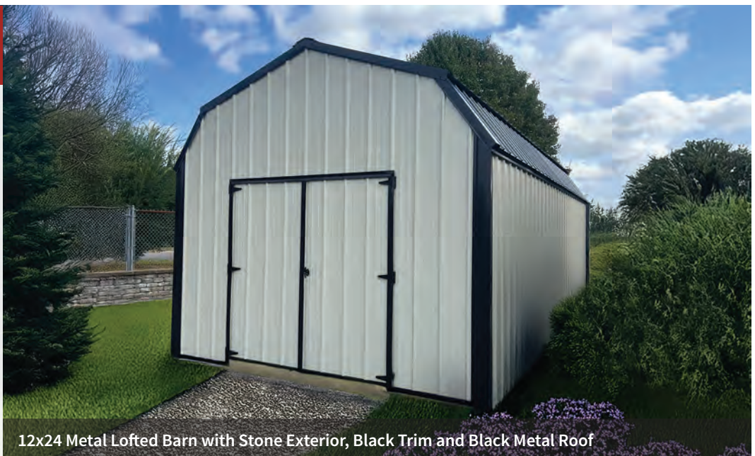
12x24 Metal Lofted Barn with Stone Exterior, Black Trim and Black Metal Roof