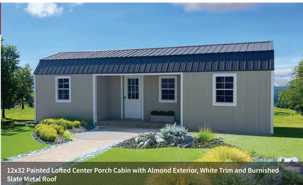
12x32 Painted Lofted Center Porch Cabin with Almond Exterior, White Trim and Burnished Slate Metal Roof

*Vertical metal siding option available.