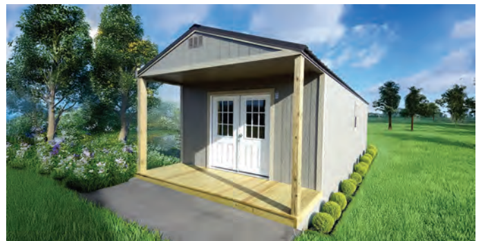
French 9-Lite Doors

* Our Secure Portable Buildings ramps are constructed using purpose made, diamond plate top mounting brackets and end cap brackets attached to four pressure treated 2x6 boards. Supplied ramps come as a pair of two that can be moved along the J channel bracket mounted to the building to make one solid structure or two separate ramps.