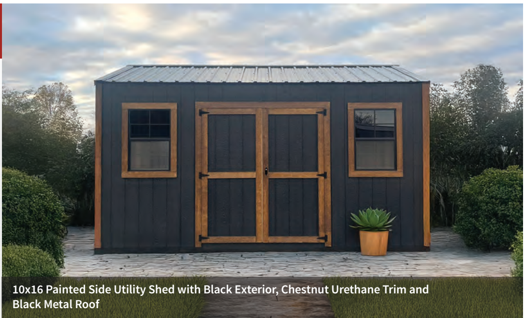
10x16 Painted Side Utility Shed with Black Exterior, Chestnut Urethane Trim and Black Metal Roof