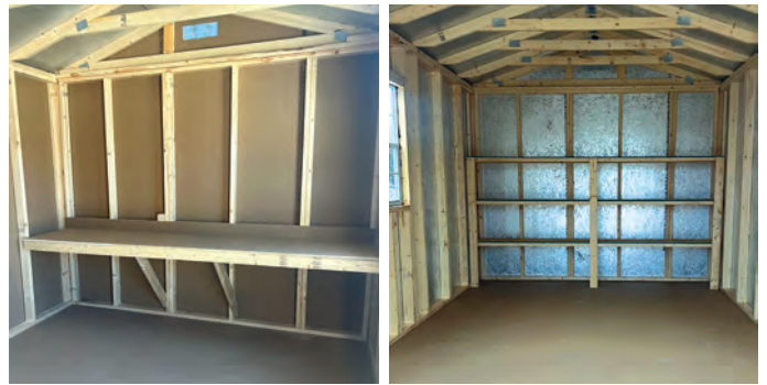
LP Roof Sheathing with SilverTech (both), LP SmartSide Panel with SmartFinish and Work Bench (left), LP SmartSide Panel with SilverTech and 3-Tier Shelving (right).