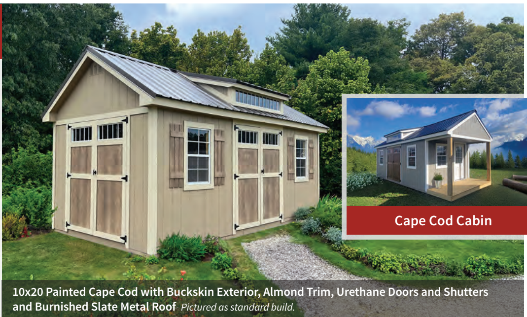
10x20 Painted Cape Cod with Buckskin Exterior, Almond Trim, Urethane Doors and Shutters and Burnished Slate Metal Roof Pictured as standard build.