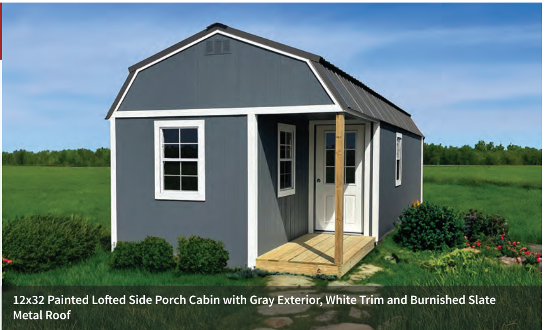
12x32 Painted Lofted Side Porch Cabin with Gray Exterior, White Trim and Burnished Slate Metal Roof

*Vertical metal siding option available.