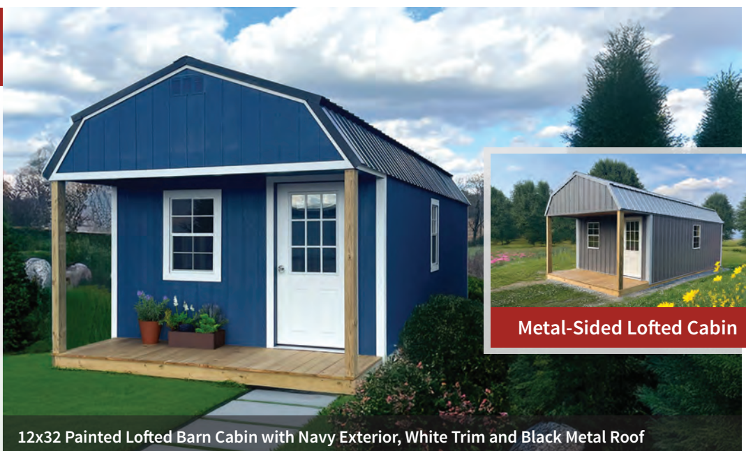
12x32 Painted Lofted Barn Cabin with Navy Exterior, White Trim and Black Metal Roof

*Vertical metal siding option available.