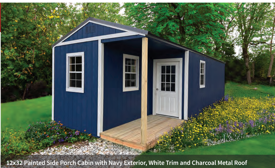
12x32 Painted Side Porch Cabin with Navy Exterior, White Trim and Charcoal Metal Roof

*Vertical metal siding option available.