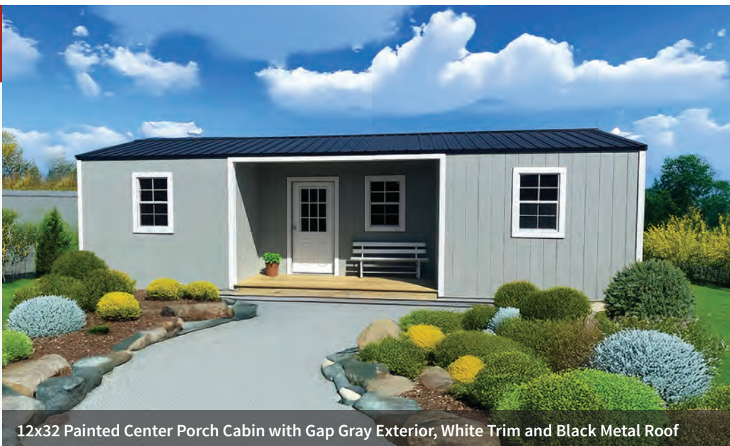
12x32 Painted Center Porch Cabin with Gap Gray Exterior, White Trim and Black Metal Roof

*Vertical metal siding option available.