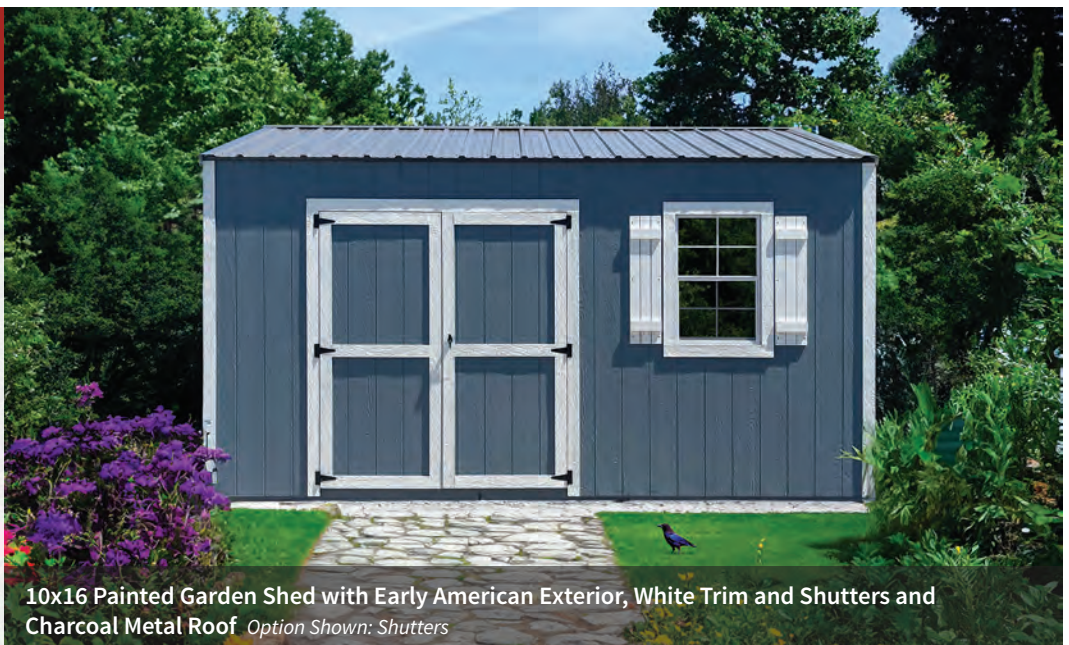
10x16 Painted Garden Shed with Early American Exterior, White Trim and Shutters and Charcoal Metal Roof Option Shown: Shutters