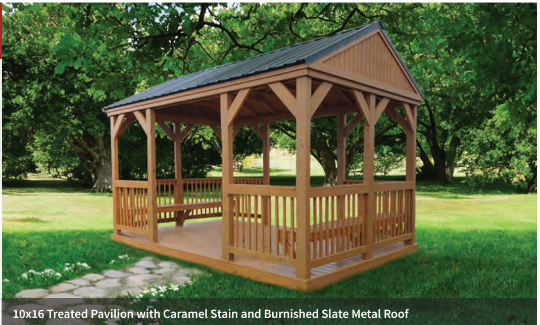
10x16 Treated Pavilion with Caramel Stain and Burnished Slate Metal Roof