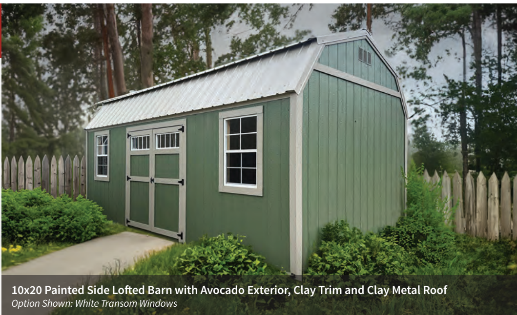
10x20 Painted Side Lofted Barn with Avocado Exterior, Clay Trim and Clay Metal Roof Option Shown: White Transom Windows