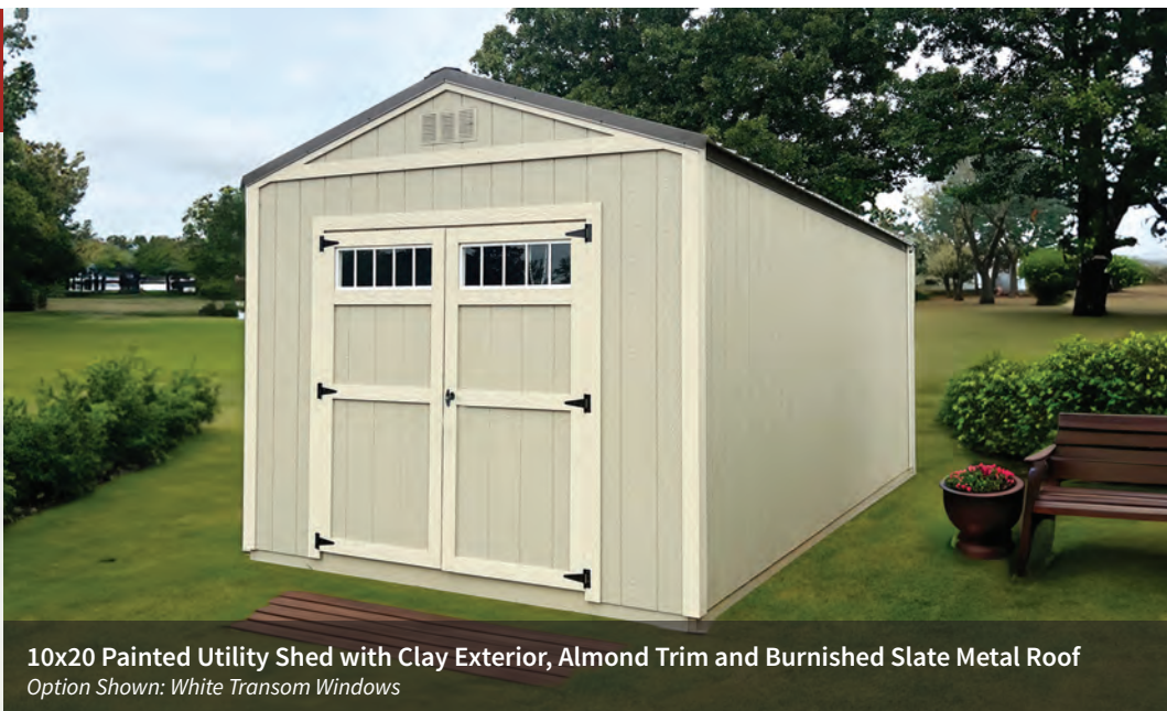
10x20 Painted Utility Shed with Clay Exterior, Almond Trim and Burnished Slate Metal Roof Option Shown: White Transom Windows