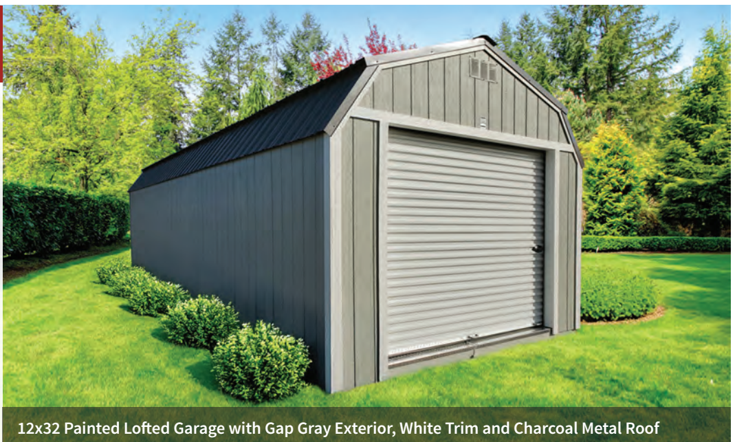
12x32 Painted Lofted Garage with Gap Gray Exterior, White Trim and Charcoal Metal Roof