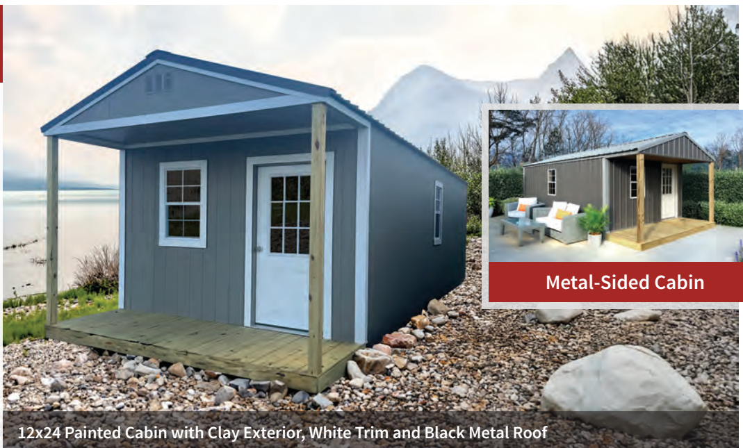
12x24 Painted Cabin with Clay Exterior, White Trim and Black Metal Roof

*Vertical metal siding option available.